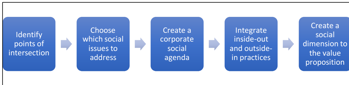
Figure 1: How to Integrate a Social Element in Corporate Strategies

Compiled by Author, based on Porter and Kramer (2006)